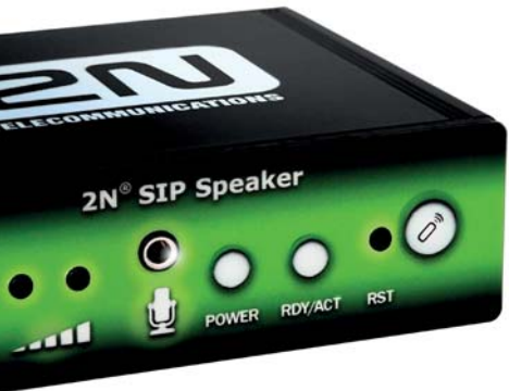
2N® SIP Speaker standalone unit

2N® SIP Speaker provides an ideal and cost effective solution for Public Address Systems and IP Paging and offers increased safety and security as access control anywhere one requires high quality audio communication and IP paging and intercom capabilities.