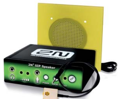
2N® SIP Speaker with loudspeaker preinstalled into flush mount or surface mount box